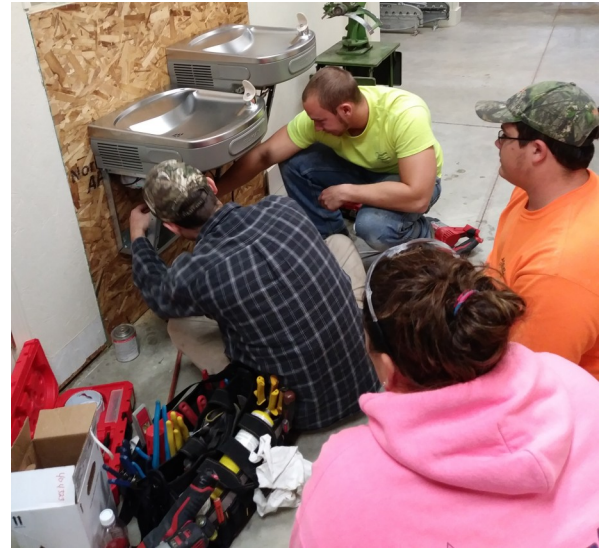
Apprentice Class volunteering downtown @ the Labor and History Museum. They were installing a drinking fountain and checking the Plumbing System. Afterwards they were given a tour of the Museum.